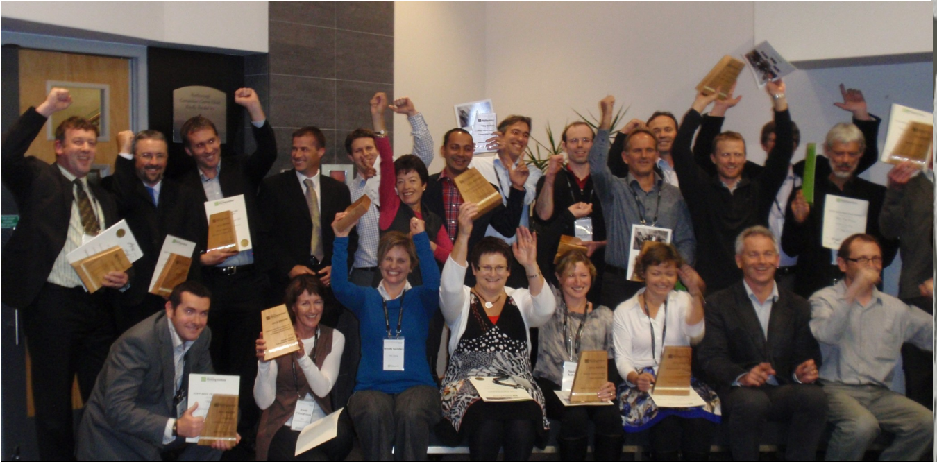
2012 Award Winners