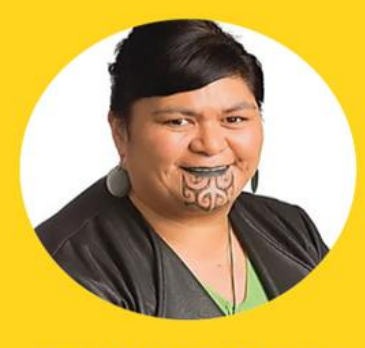
Hon Nanaia Mahuta Labour Government Minister